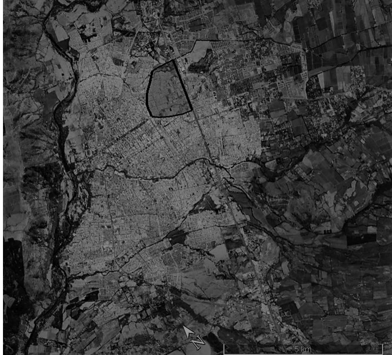
Figure 2 Map of Talca highlighting Arturo Prat