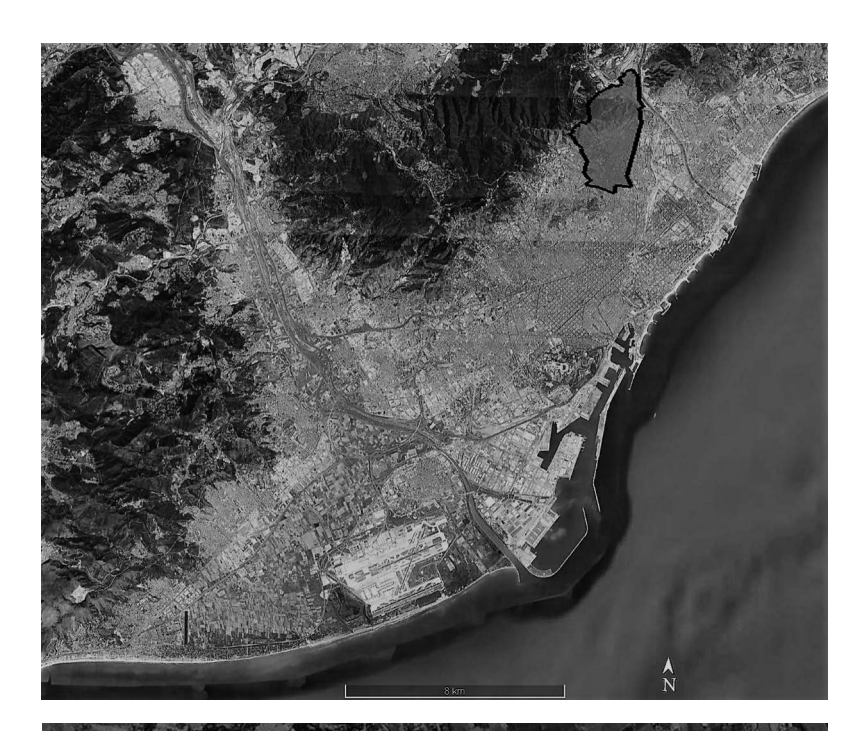
Figure 1 Map of Barcelona highlighting Nou Barris