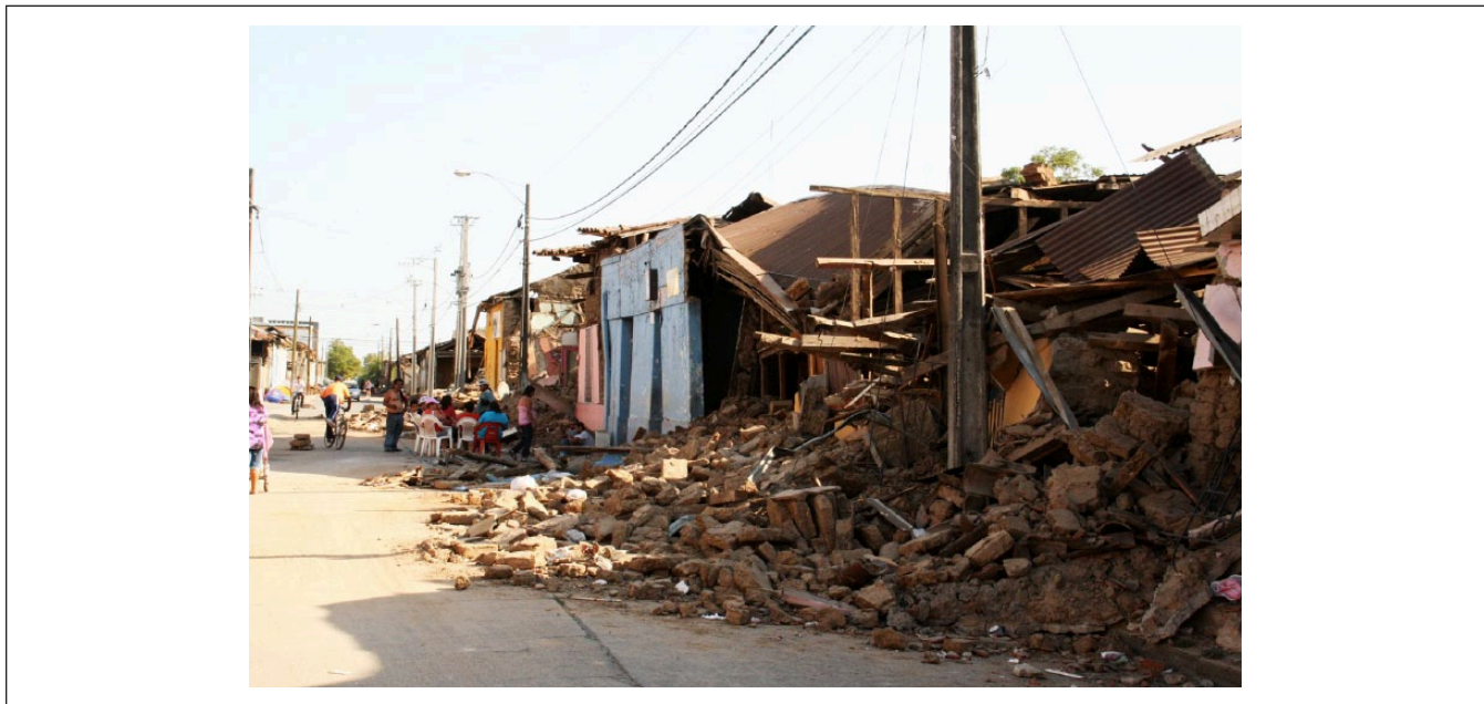
Figure 2. 2010 earthquake damage in Talca. See neighbors living and socializing in the street.