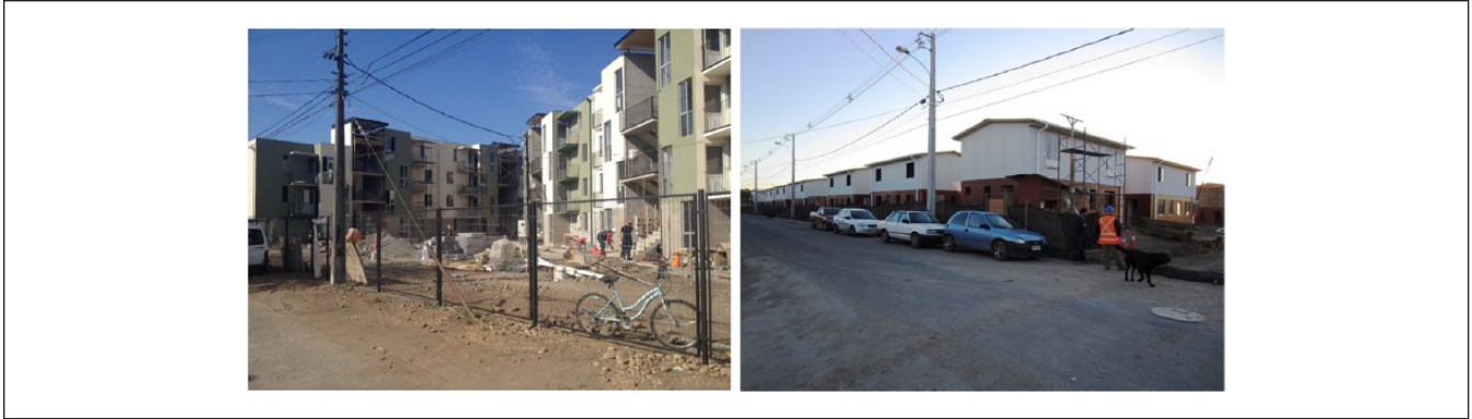
Figure 5. Typological contrast between the housing projects Los Maitenes (left) and Villa El Parque III (right). The latter represents the typically favored post-earthquake housing project typology. This complex has 400 two-story social housing units of 47 m 2 each.

committee. The participation of a local construction company was key. The collaboration between the committee and this company, plus the work of the NGO Surmaule and the design of the architectural NGO Reconstruye, made possible the development of the first post-earthquake multifamily, inclusionary housing project in a central urban area in Chile.