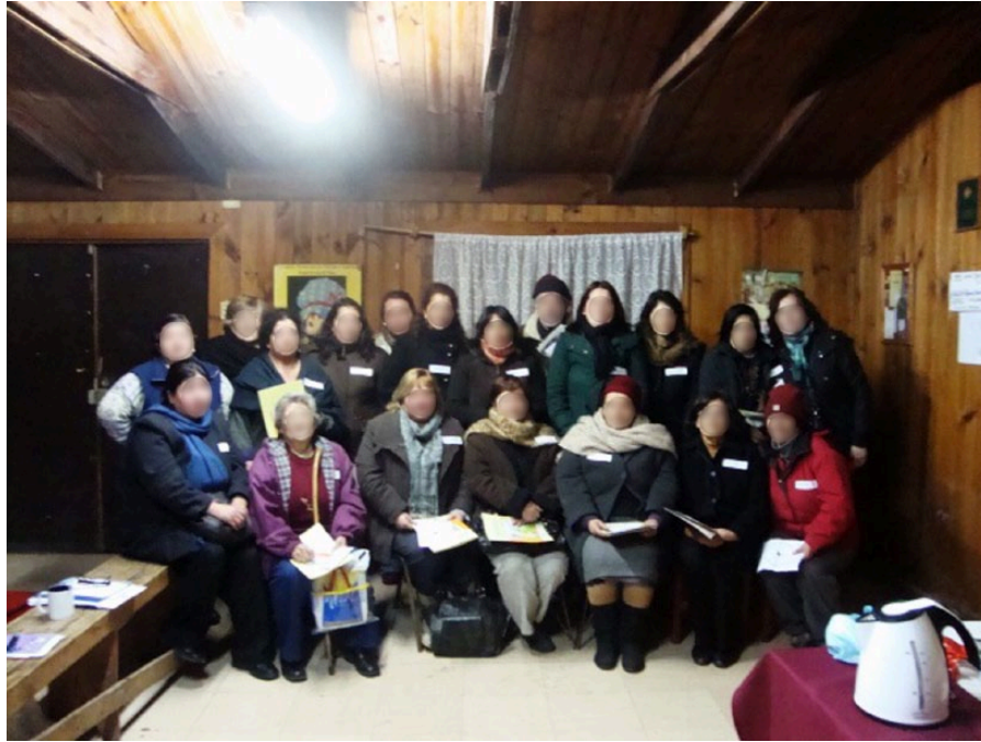
Figure 4. Meeting of landless committee.

Note: Observe the primary participation of women and the apparent lack of heating conditions in the wooden cabin.