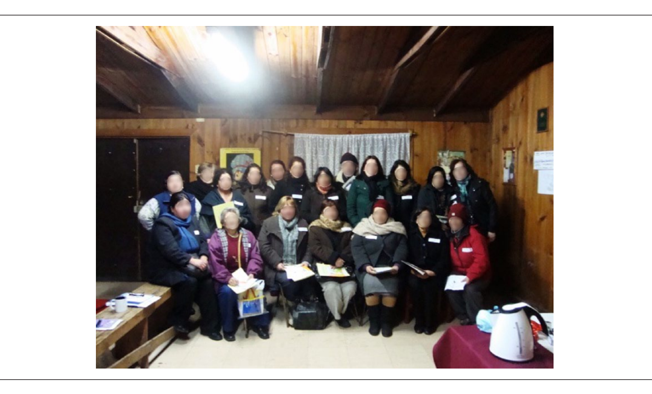
Figure 4. Meeting of landless committee. Note: Observe the primary participation of women and the apparent lack of heating conditions in the wooden cabin.

allow them to increase their purchasing capacity and many families in collective or rented houses did not meet the conditions to qualify for subsidies. The only possibility for people not to be displaced was to organize and identify political opportunities to make demands on the state.