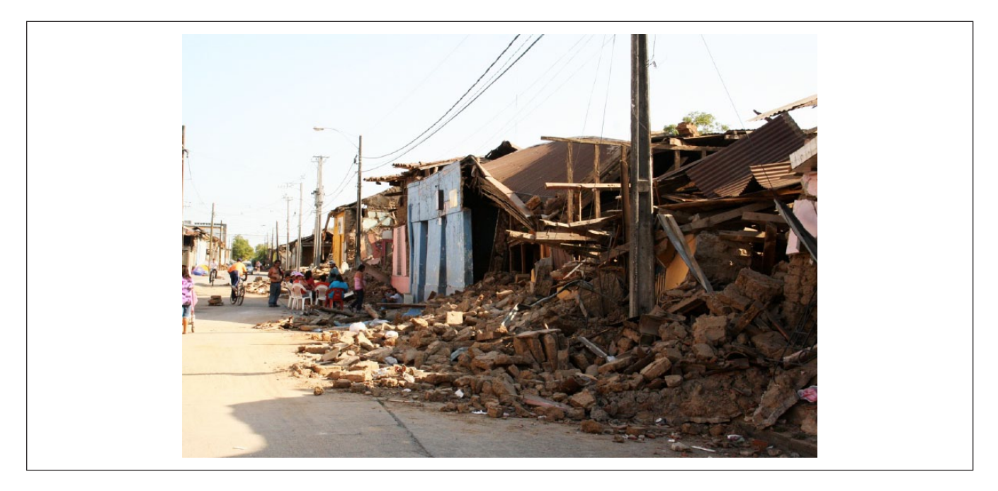
Figure 2. 2010 earthquake damage in Talca. See neighbors living and socializing in the street.